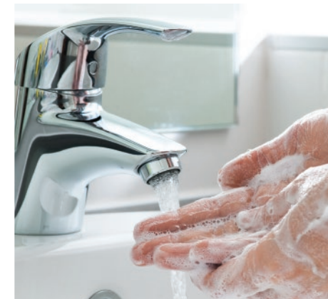
Washing Your Hands

A proactive approach must consist of three essential components for protection against virus transmission in shared environments.