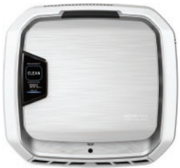
AERAMAX PRO 3

22.6" h x 14" w x 4.1" d 135-225 sq ft. coverage* 3 Year Warranty 10.6 lbs. | 1.4 amp