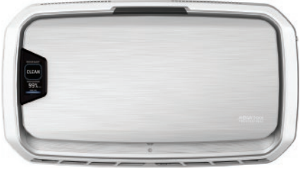
AERAMAX PRO 4

19.6" h x 20.9" w x 9" d 300-500 sq ft. coverage* 5 Year Warranty 20.2 lbs. | 2 amp