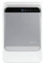
AERAMAX PRO 2

Office buildings are a prime example of a space that we share for upwards of 9 hours every day and have a constant flow of visitors, vendors and employees who bring viruses, germs and pathogens into the workplace with them. Couple that with odors from food left in wastebaskets, conference rooms and common areas and it's an IAQ hot spot.