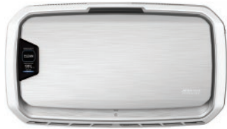
AERAMAX PRO 4

Trendway can help you plan your facility air purification safety program. After consideration of hot spots and HVAC airflow, we will calculate and customize the installation locations and sizes according to your air purification needs. You can feel confident in the design for a safe, clean air environment.