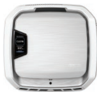
AERAMAX PRO 3