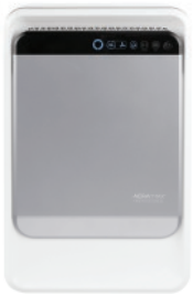
AERAMAX PRO 2

Constructed with superior components, high-grade filters and reinforced housing.