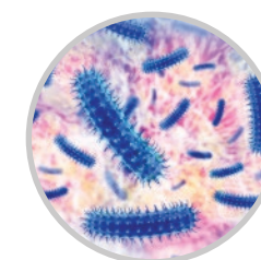
Viruses / Bacteria