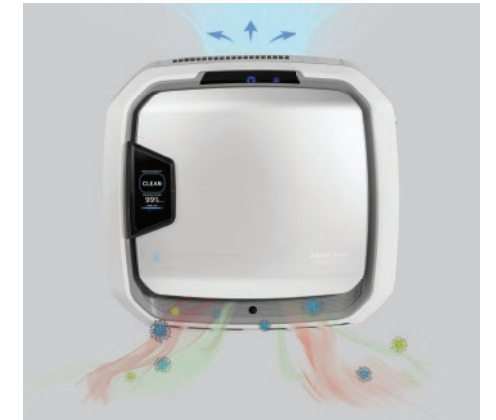
Cleaning the Air