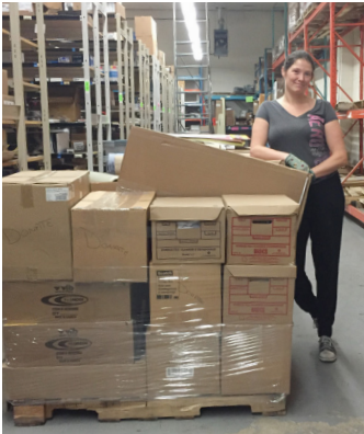
Distribution Team Member with skid of donations of supplies to schools.