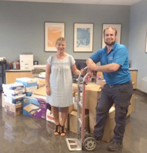
School supplies donated at Gordon Head Middle School

Mustard Seed Fair Start school supply program 700 kits