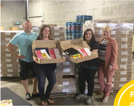
Team Members donating products for the Mustard Seed School Supply Program.